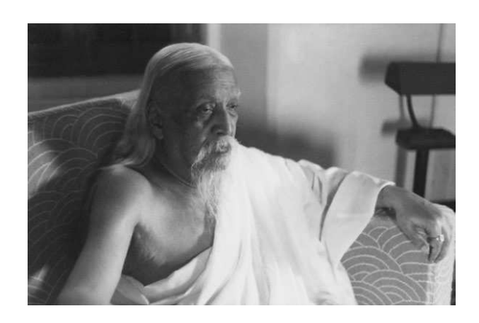
Figure 1: Sri Aurobindo (15 August 1872 - 5 December 1950)

VOLUME 21 and 22 THE COMPLETE WORKS OF SRI AUROBINDO Sri Aurobindo Ashram Trust 2005 Published by Sri Aurobindo Ashram Publication Department Printed at Sri Aurobindo Ashram Press, Pondicherry PRINTED IN INDIA