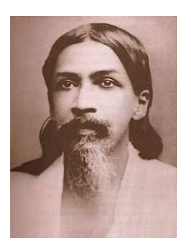
Sri Aurobindo, 1916

From Volume 21 and 22 of The Complete Works of Sri Aurobindo