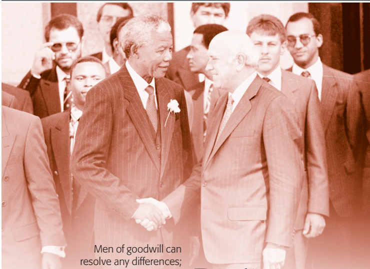
Men of goodwill can resolve any differences; Nelson Mandela and F.W. de Klerk shake hands over the end of apartheid.

Psychiatry represents a destructive instrument of social control. Its methods of mind and behavior control continue to wreak misery on an international scale.