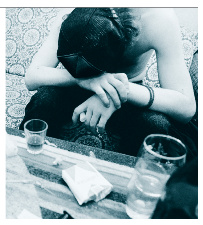
While drug addiction can be overwhelming, it is important to know that psychiatry, its diagnoses and its drugs, are not working. Their drugs and methods only chemically mask problems and symptoms; they cannot and never will be able to solve addiction.

Leshner's most revealing statement tells us exactly where curing addiction fits into psychiatric drug rehabilitation. He says, "...a reasonable standard for treatment success is not curing the illness but managing it, as is the case for other chronic illnesses." Actually curing drug addiction doesn't enter into it at all.